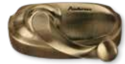
Antique Brass | Bright Brass Brushed Chrome | Distressed Bronze Distressed Nickel | Oil Rubbed Bronze Polished Chrome | Satin Nickel