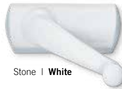
Stone | White