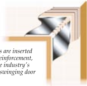
PVC blocks are inserted into steel reinforcement, forming the industry's most solid swinging door corner.