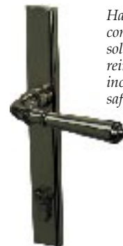
Hardware, available in complementary colors, is solidly attached to steel-reinforced door sashes for increased durability and safety.

Doors are available in a variety of styles, sizes and configurations.